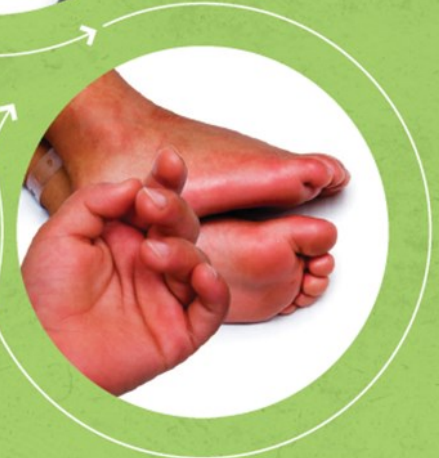
Red Palms/Soles Swollen Hands/Feet