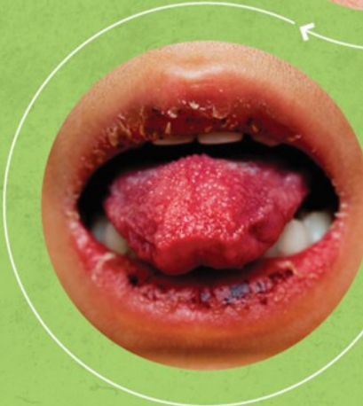
Strawberry Tongue and Red, Cracked Lips